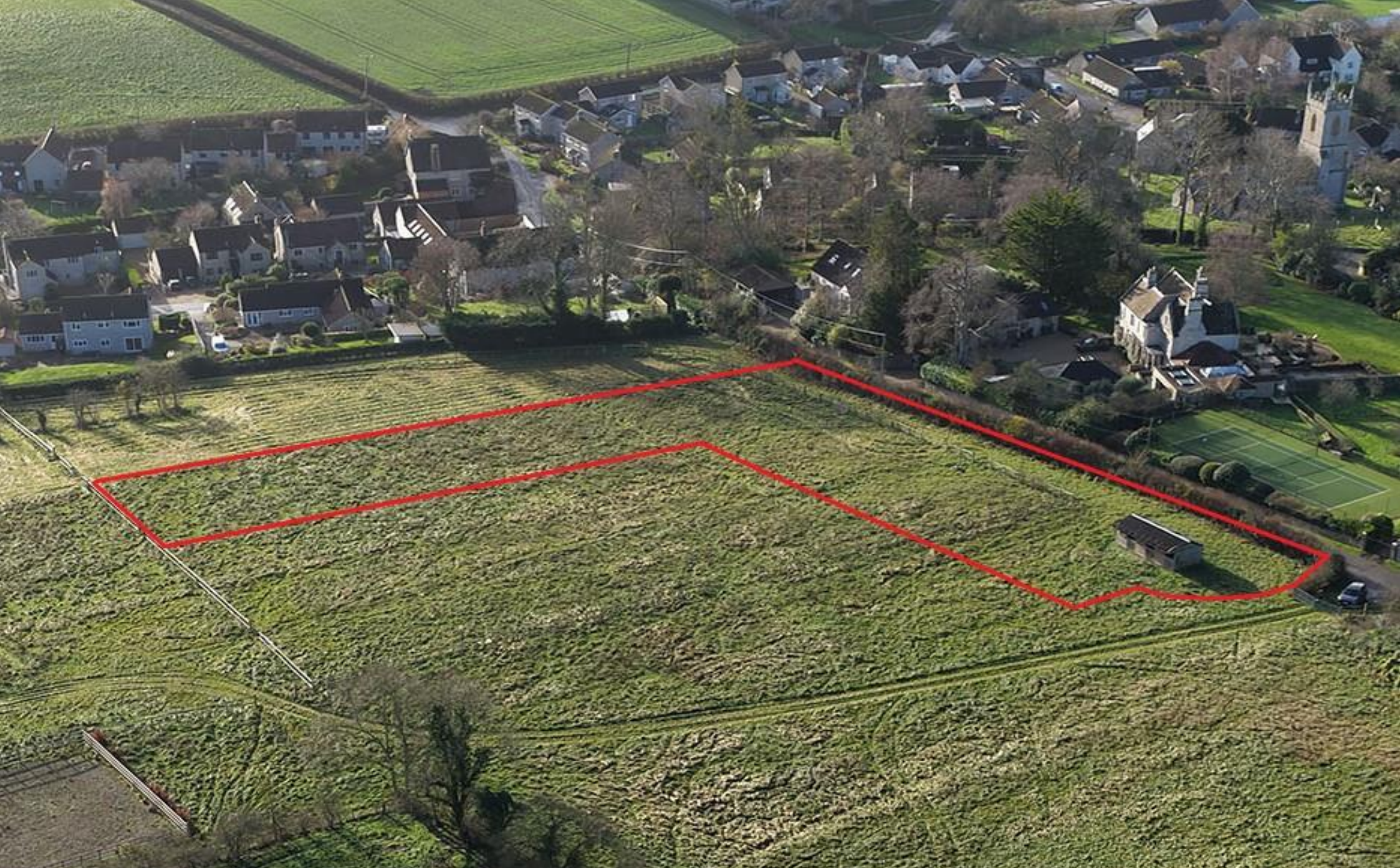
Church Hill View Church Hill, Pitney, TA10 9AR